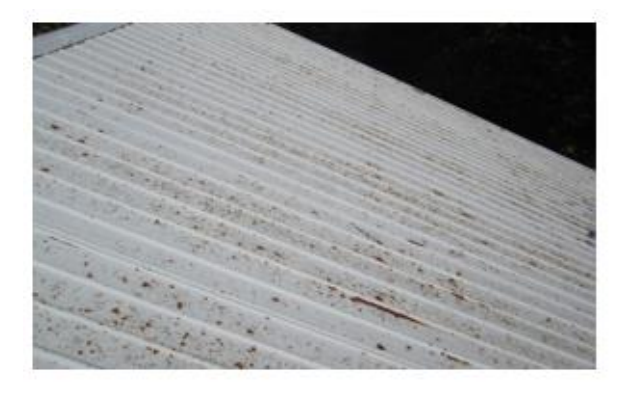
Figure 5 Metal roof before coating