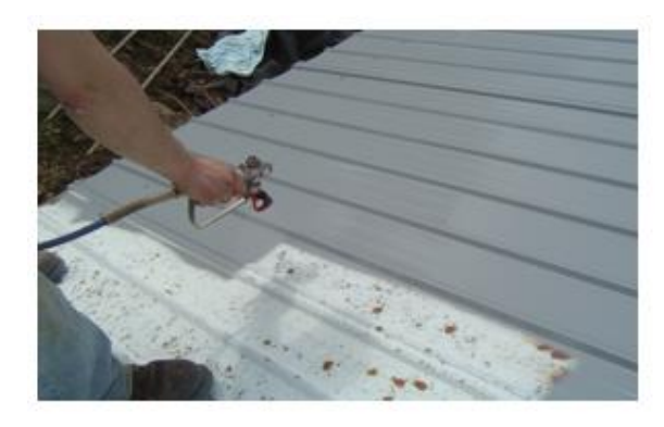
Figure 11 Panels being coated