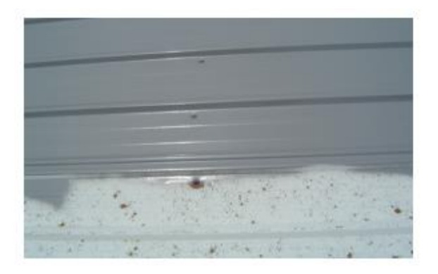
Figure 12 Panels with and without coating