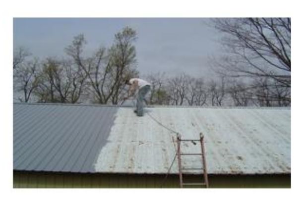
Figure 10 Power wash thoroughly