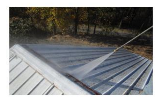
Figure 9 Power wash at ridge