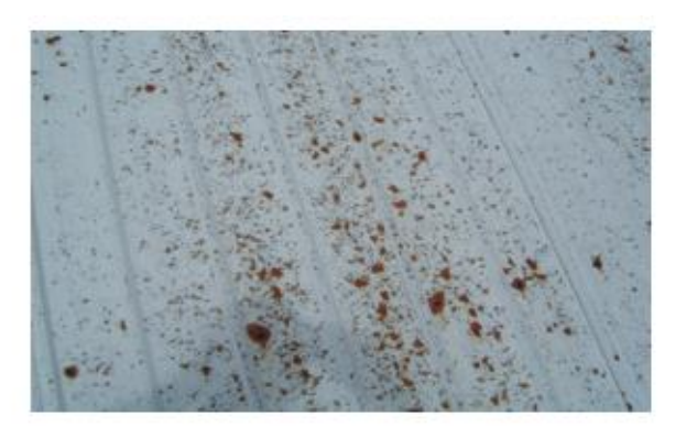
Figure 6 Metal roof before coating