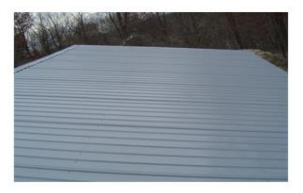
Figure 14 Roof coated with GE Enduris