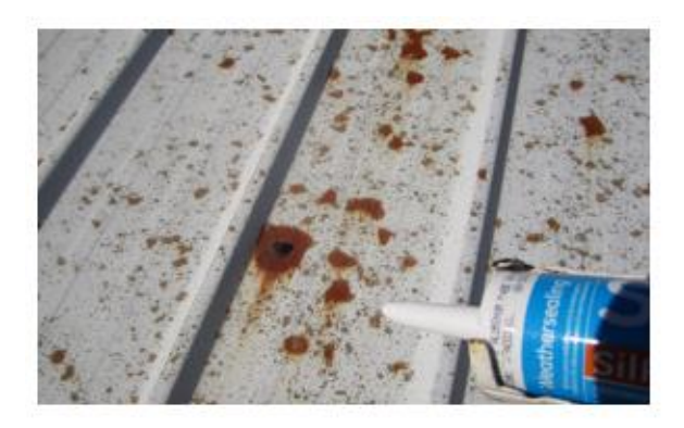
Figure 7 Fill small holes with sealant