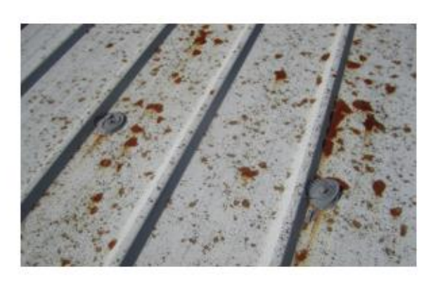
Figure 8 Cover fastener heads as needed