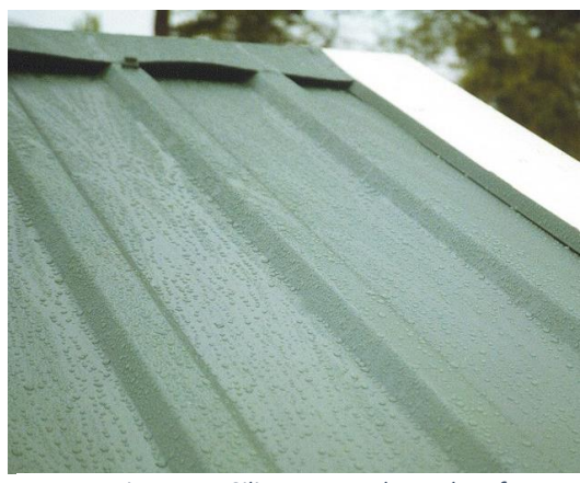
Figure 4 Silicone coated metal roof

For a coating to be effective, strong and durable adhesion of a coating must be attained and maintained to existing aged metal surfaces and finishes. GE silicone coatings and related accessories are formulated using specific adhesion promoters and other ingredients with