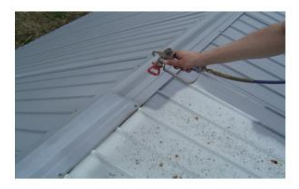
Figure 13 Coating of ridge cap